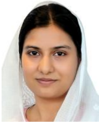
Iqra Choudhary Member of Parliament, Kairana, Uttar Pradesh

Iqra Hasan Choudhary, is one of Lok Sabha's youngest MPs, elected in 2024, and representing Kairana, Uttar Pradesh, from the Samajwadi Party. A graduate from SOAS University, UK, in international politics and governance, she has emerged as a strong advocate for women's representation, minority rights, and youth leadership in Parliament. She frequently engages in debates on gender equity and constitutional protections, and is a member of multiple key parliamentary committees like Health and Family Welfare, Estimates, and Empowerment of Women. With her dynamic presence, she is being watched as an influential young leader reshaping inclusive politics in North India.