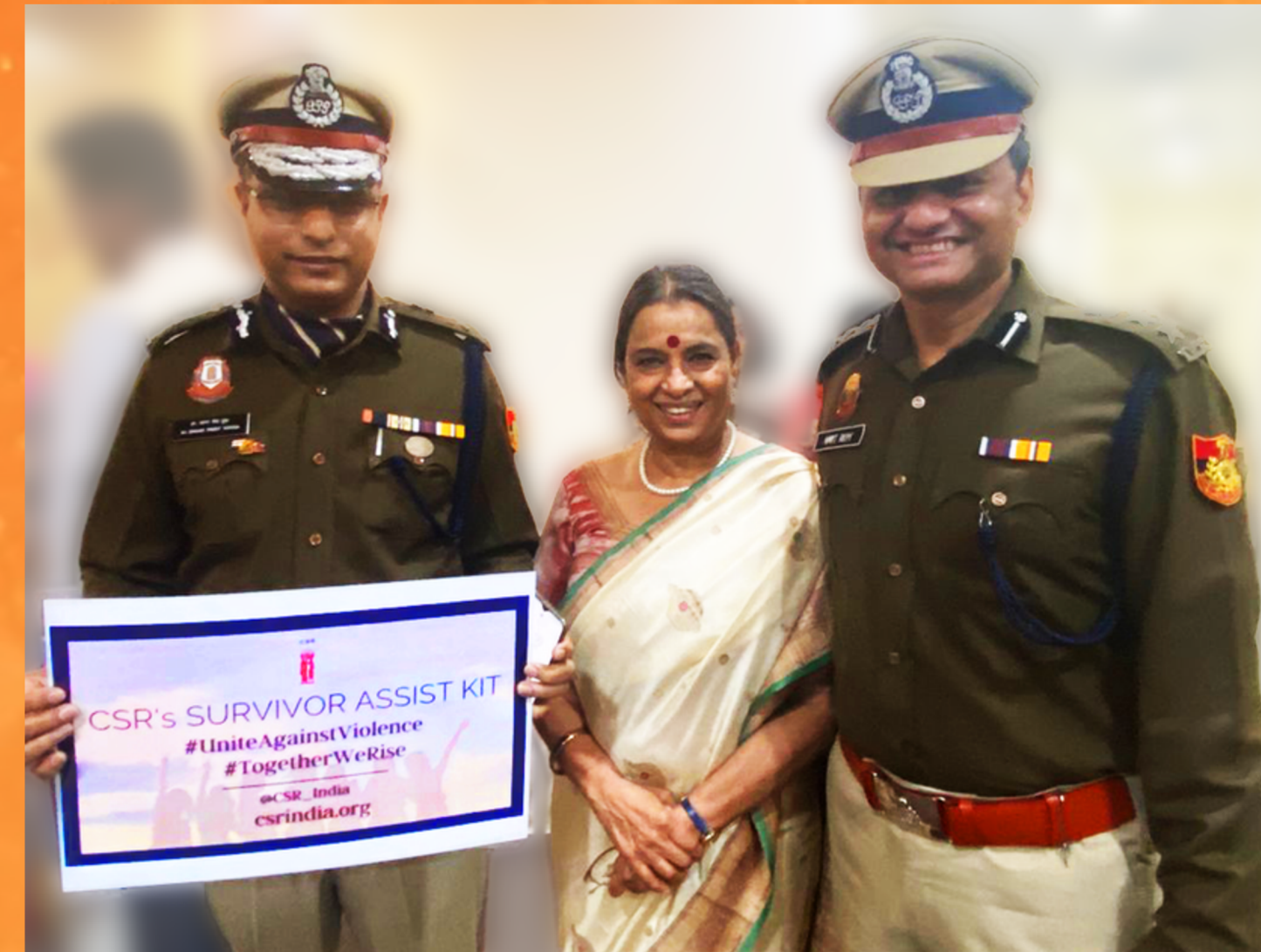
SURVIVOR ASSIST KIT