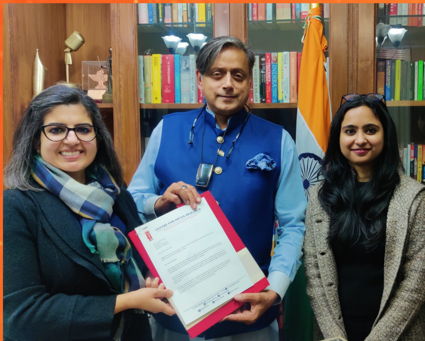
TEAM CSR WITH DR SHASHI THAROOR,