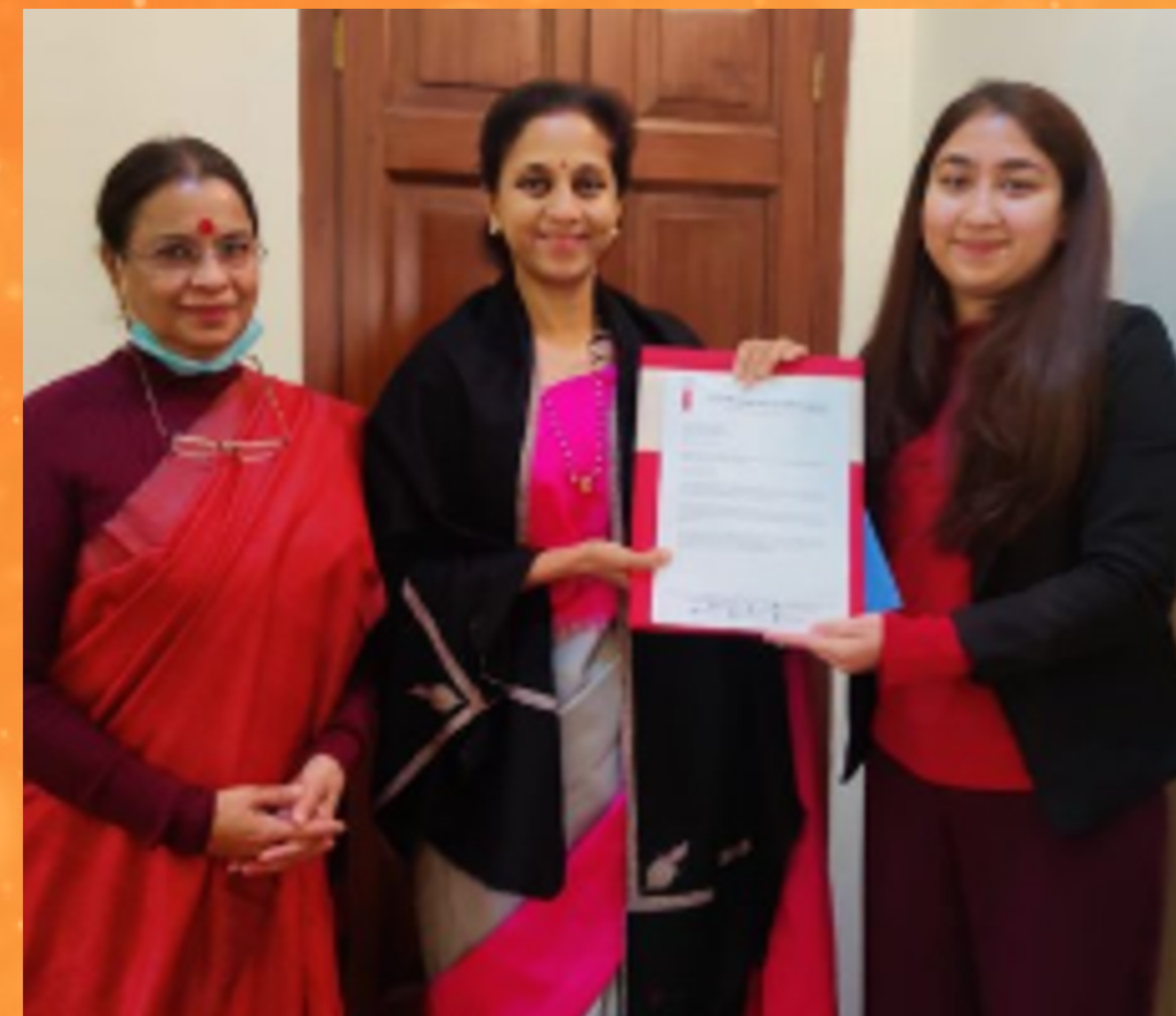
TEAM CSR WITH MP SMT SUPRIYA SULE JI,